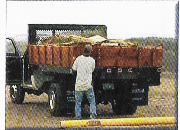
Even though this load's sides and bottom are secure, yard debris can easily be blown from the bed of this truck.