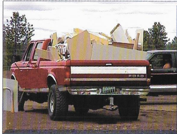
Even though some large pieces of material are acting as a barrier for other large pieces, small debris can easily fall or fly out of this pickup bed.