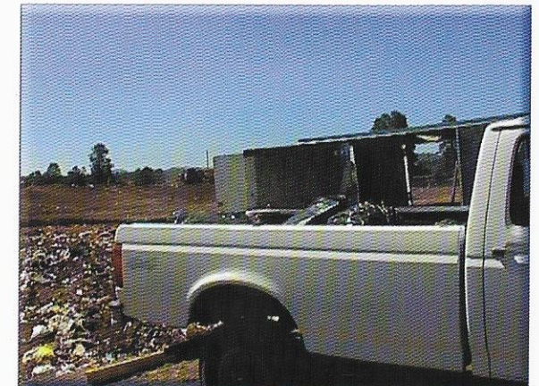
This truck is hauling ONLY secured garbage bags. The bags must NOT be above the sides of the truck.